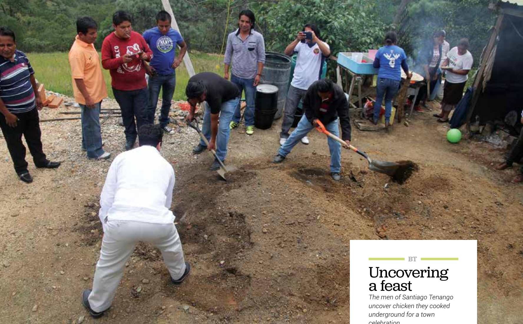
BT Uncovering a feast The men of Santiago Tenango uncover chicken they cooked underground for a town celebration.

the shoe distribution was followed by distributions of MannaPack food packages. Then workshops.