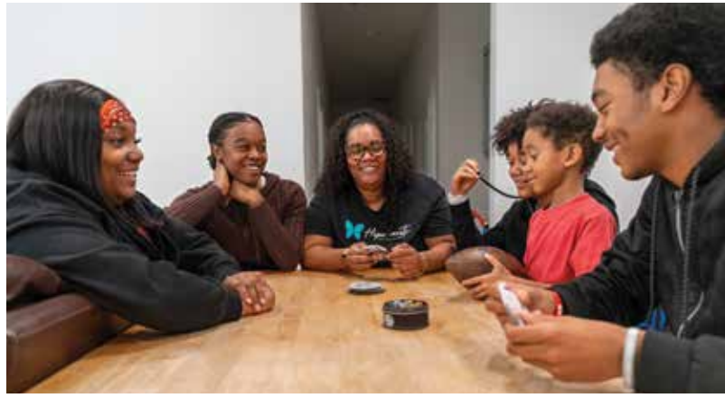
Building a bright, hopeful future, strengthens family bonds.

of this cycle of hope, proving that when mothers are empowered, their children inherit a legacy of possibility and purpose. BT